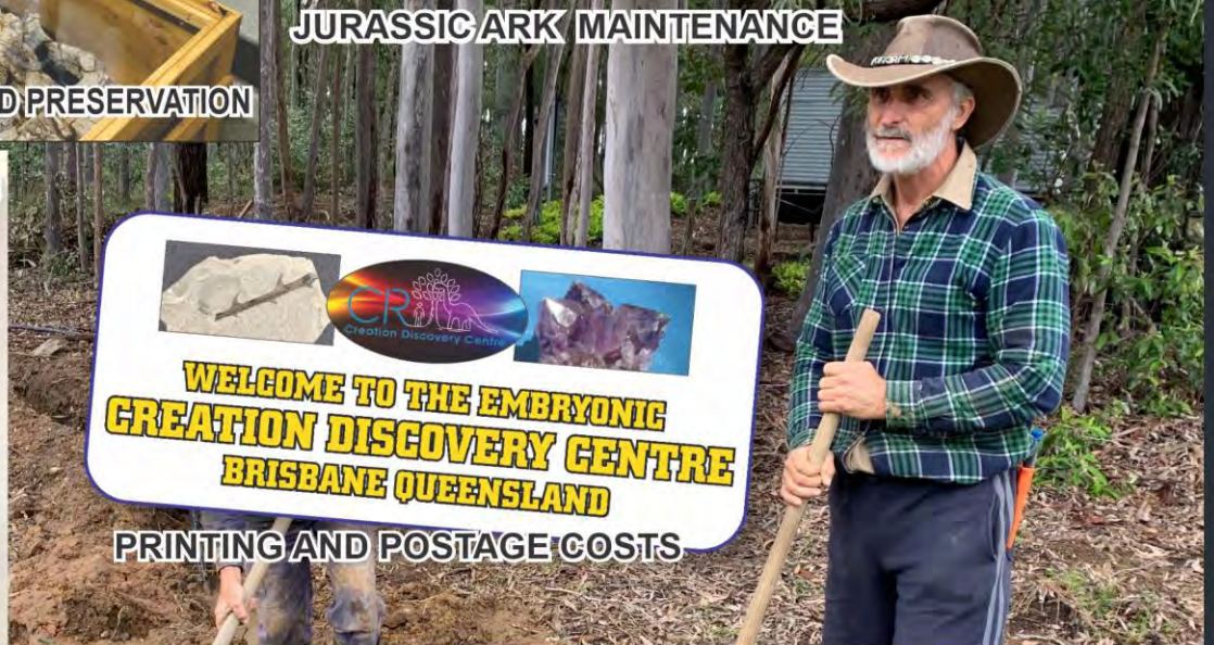
PRINTING AND POSTAGE COSTS