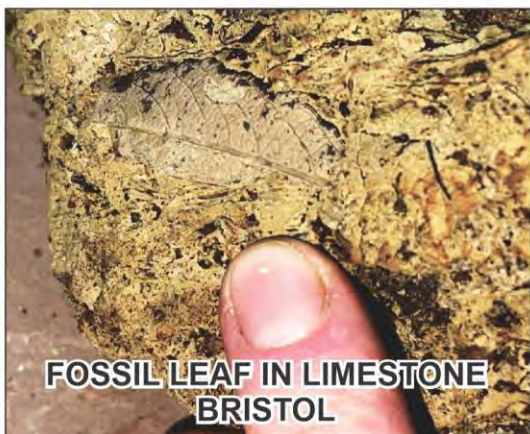
FOSSIL LEAF IN LIMESTONE BRISTOL

Bacterial mulch gives a growth rate of 2-300 times the evolutionists long slow age. They don't do real science they do pagan philosophy designed to eliminate both 6 day creation and the Real Creator Christ.