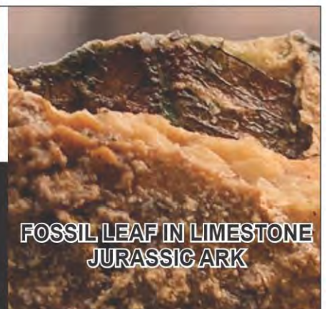
FOSSIL LEAF IN LIMESTONE JURASSIC ARK

JURASSIC ARK MAKING RAPID FOSSILS Started 23rd June 2016 Photo right June 15th 2022 Total experiment almost 6 years