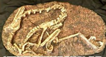
NEW EVIDENCE DISPLAYS DROWNED VELOCIRAPTOR