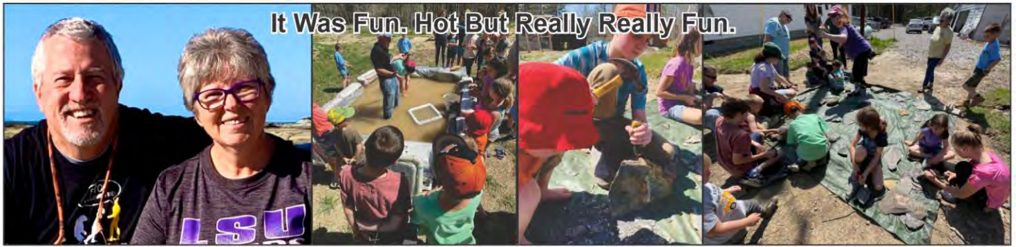
It Was Fun. Hot But Really Really Fun.

HOME SCHOOL DAY USA .. Finding sharks teeth, splitting fossils and checking out rapid rocks at our East Tennessee Homeschool event (19th - March) went great. One family with 2 kids showed up two hours early so we did the presentation and activities twice. The other 20-30 kids came at the right time. So after reading the Biblical account of the flood we gave a brief presentation about geologic layers and fossils with displays of rocks from the different layers as well as some polystrate tree fossils I had collected.