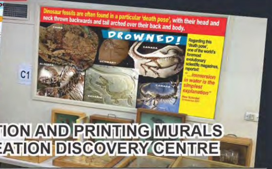
PRODUCTION AND PRINTING MURALS NEW CREATION DISCOVERY CENTRE