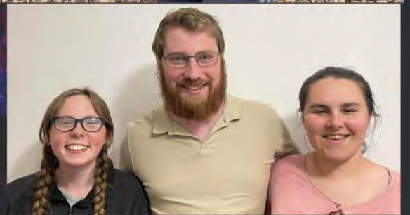
CREATION RESEARCH YOUTUBE PROGRAMS - UK STAFF & MUSEUM COSTS