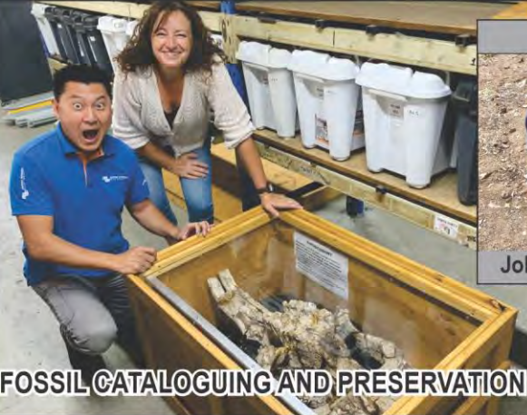
FOSSIL CATALOGUING AND PRESERVATION